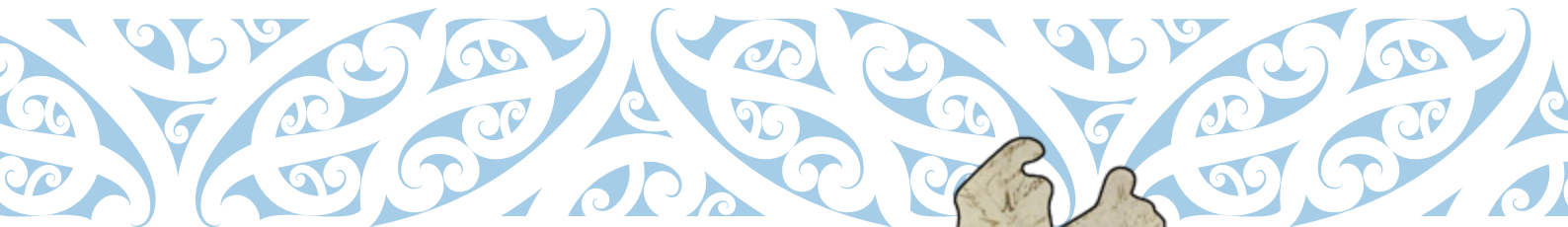
Illustration by Kihere Jahnke-Waitoa